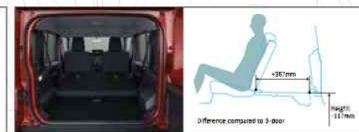
LUGGAGE AREA USABILITY