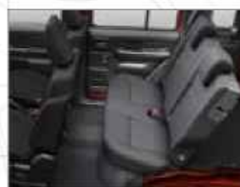
REAR SEAT POSITION